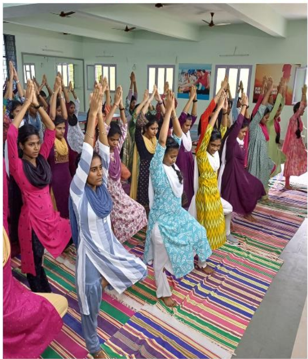
YOGA PRACTICE BY GIRLS STUDENTS