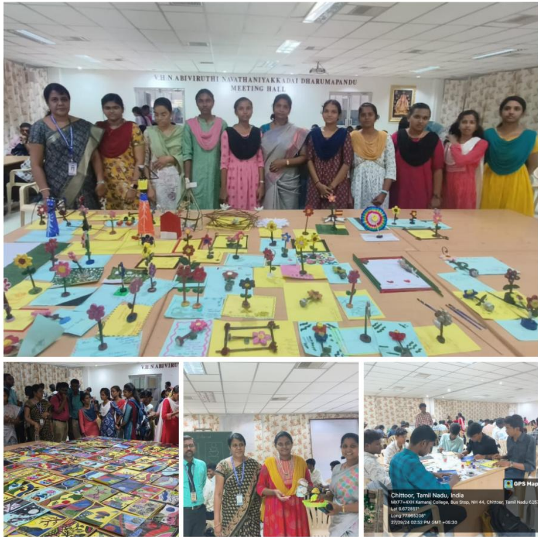
ART AND CRAFT DISPLAY BY STUDENTS