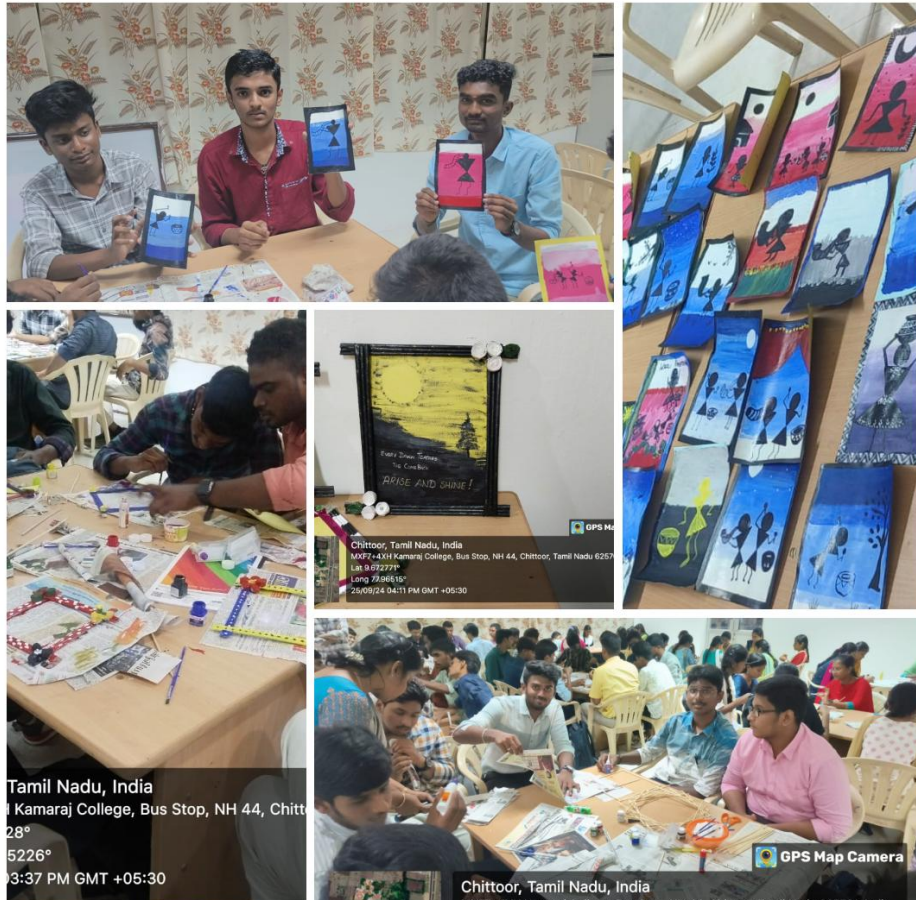
ART AND CRAFT DISPLAY BY STUDENTS