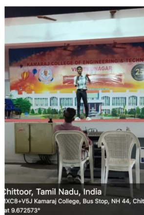
Chittoor, Tamil Nadu, India XCB+V5J Kamaraj College, Bus Stop, NH 44, Chittoor at 9.672573°